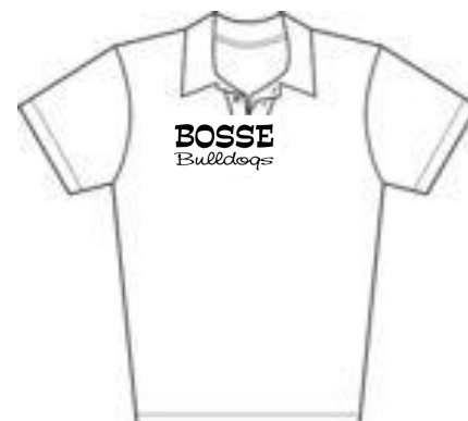
Short Sleeve POLO Shirts only $10 each